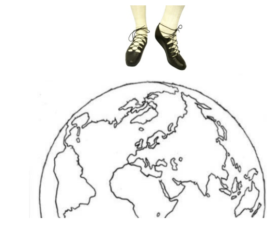
We're looking forward to seeing you in Freiburg!

Enjoy familiar dances from islands and highlands and discover new delights, inspired by exotic places, faraway friends, lofty heights and local heroes.